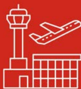
Airport Media Houston Hobby (HOU)

We're excited to share the SOHO approved Out-of-Home Advertising Opportunities!