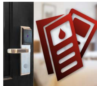
HOTEL ROOM DROPS