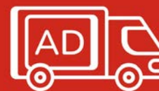
Digital Mobile Trucks