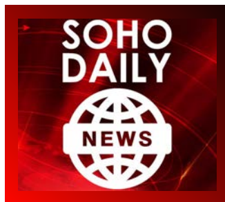
SOHO DAILY NEWS