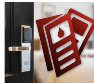
HOTEL ROOM DROPS